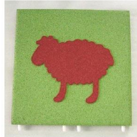
Colour Impact Protection Slabs: green,