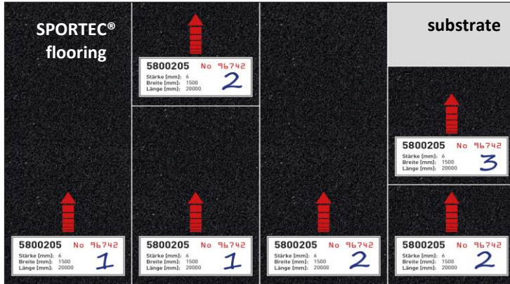
Rolling out the consecutive rolls in the same direction

As shown in the prior picture, where possible use material from the same production batch, and install rolls in ascending number order. To find the production batch reference and the roll numbers, refer to the labels on the underside of each roll.