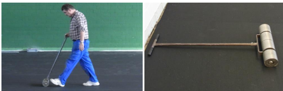
Scrolling of the floor with a pressure roller

After the adhesive has grabbed but before adhesive is fully cured, contact pressure should be applied to the surface with a roller to eliminate air bubbles underneath the material.