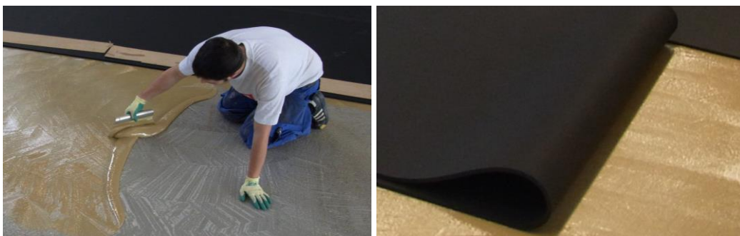
Adhesive applying onto clean substrate; roll out into the adhesive bed

Apply the glue evenly with a notched trowel over the area where SPORTEC ® flooring will be rolled out. Use a notched trowel with a notch depth as recommended by the adhesive manufacturer to achieve the correct spread rate. After the glue is spread out correctly, roll the material out into the adhesive bed (please take note of different adhesives curing time).