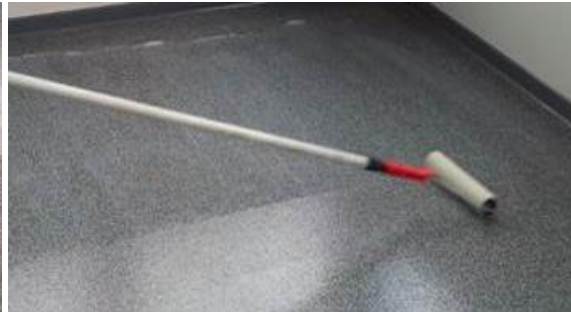
Applying of the coating