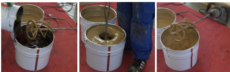
Mixing of the 2-component PU adhesive

Before installation mix both components of adhesive. Directly after mixing, pour all of the glue out evenly over the prepared installation area (approx. 0.7kg/m 2 if using SPORTEC 700 2K-PU adhesive ) so that none is left in the pot. Follow adhesive manufacturer's instructions if not using SPORTEC 700 2K-PU adhesive.