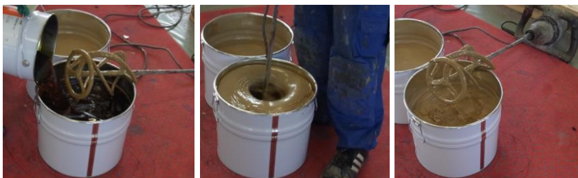
Mixing of the 2-component PU adhesive

The SPORTEC color floor covering material is delivered in rolls and must be stored on site for 1-2 days at a temperature between 15 °C and 25 °C before installation. On the day prior to installation roll out the material fully, but do not bond down, so that the rolls can relax.