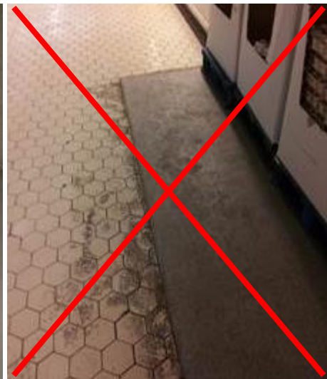
uneven, not suitable substrate