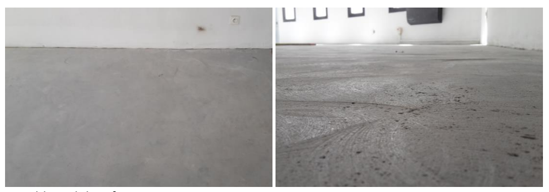
Suitable, solid surface

SPORTEC® edge- & corner ramps should not be installed on loose or dynamic sub-bases. A solid base is required to ensure stability and performance.