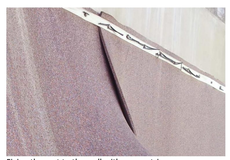
Fixing the mat to the wall with screw strips

Mount the fixation (e.g. with a rail system or clamping/screw strips) on the wall with dowels and screws, so that they can permanently bear the weight of the fixed protective mats.