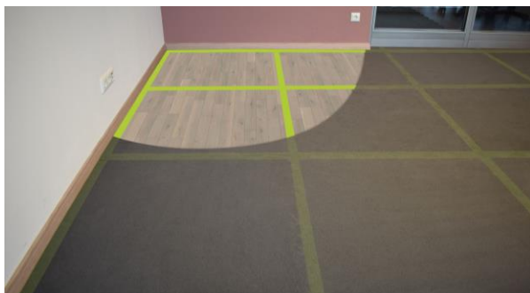
at 6mm : gluing at the edge area and at the interlocking area

Before laying the puzzle mats, measure the required strips of double-sided adhesive tape on the substrate as required and then stick them on, so that the puzzle mats can then simply be stuck on these strips during installation.