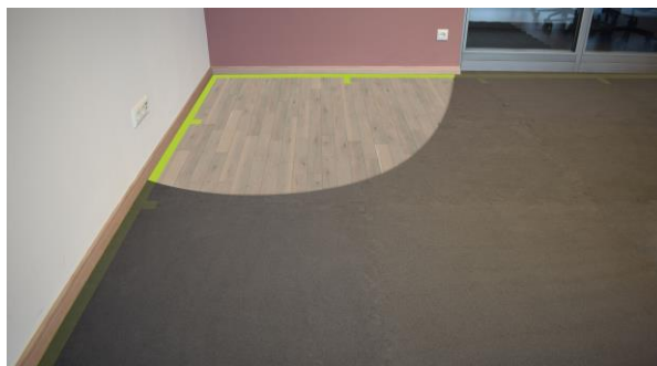
at 8-10mm : gluing only at the edge area or at the edges of cut-to-size mats

The puzzle mat with its surrounding teeth creates a stable bond when laid. But take care to align the teeth of a puzzle mat correctly as each side of the puzzle mat is different.