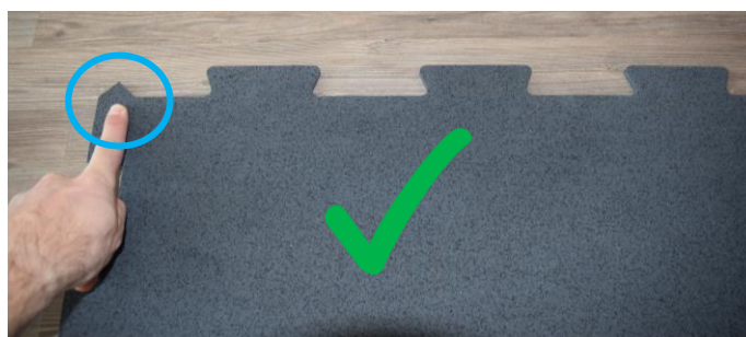
Alignment of the puzzle mat: bring the mat into position by turning or flipping