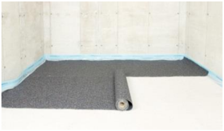
Installation of the individual rolls joint to joint

Lay the first roll along the wall with edge insulation strips. For orientation, a chalk line can be drawn as a laying aid. Take care to ensure that the roll is laid with the underside (this is profiled) downwards and rolled out straight. Lay the rolls in the same direction everytime and joint to joint, so that there is no gap between the sheets. The joints can be covered with an adhesive tape to avoid sound bridges.