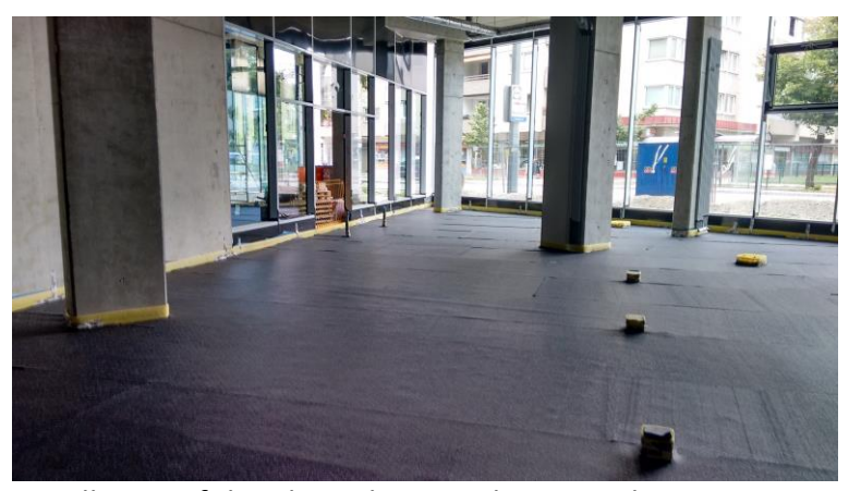
Installation of the elastic layer in the entired room