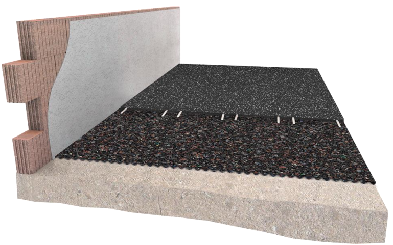
Installation of SPORTEC® style tiles onto the elastic layer