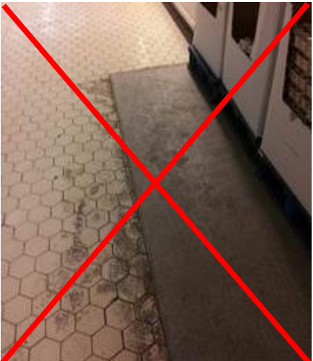
Even, suitable substrate made of poured screed