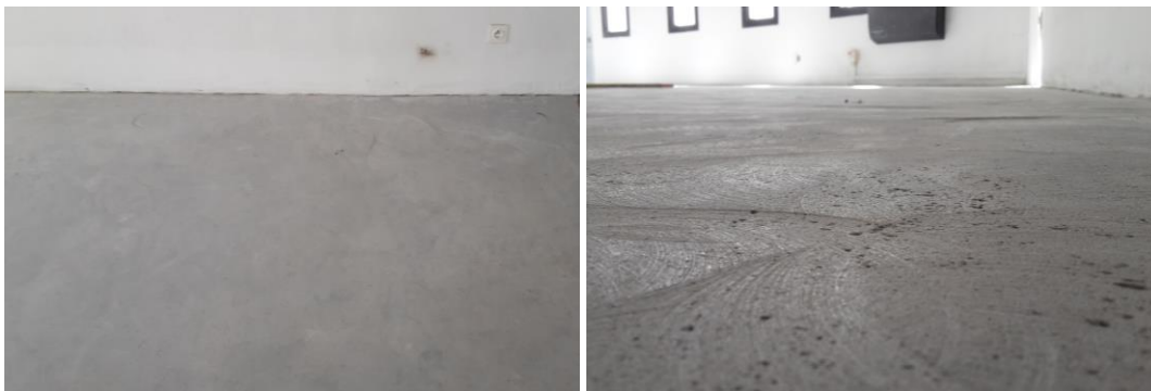
Suitable, solid surface

SPORTEC® edge- & corner ramps should not be installed on loose or dynamic sub-bases. A solid base is required to ensure stability and performance.