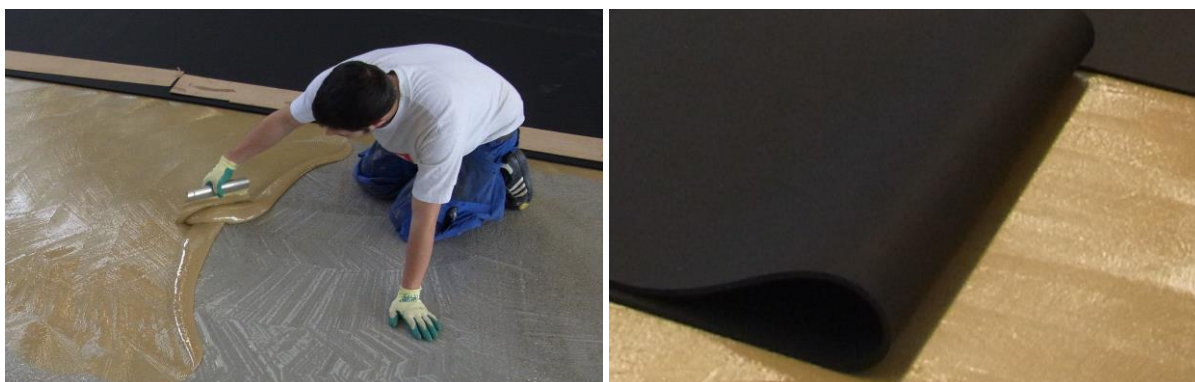
Adhesive application to clean substrate;

Apply the glue evenly with a notched trowel over the area where the SPORTEC® elastic layer will be rolled out. Use a notched trowel with a notch depth as recommended by the adhesive manufacturer to achieve the correct spread rate. After the glue is spread out correctly, roll the material out into the adhesive bed (please take note of different adhesives curing time).