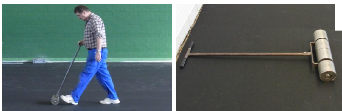
Scrolling of the floor with a pressure roller

After the adhesive has grabbed but before adhesive is fully cured, contact pressure should be applied to the surface with a roller to eliminate air bubbles underneath the material.