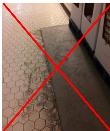
not suitable substrate