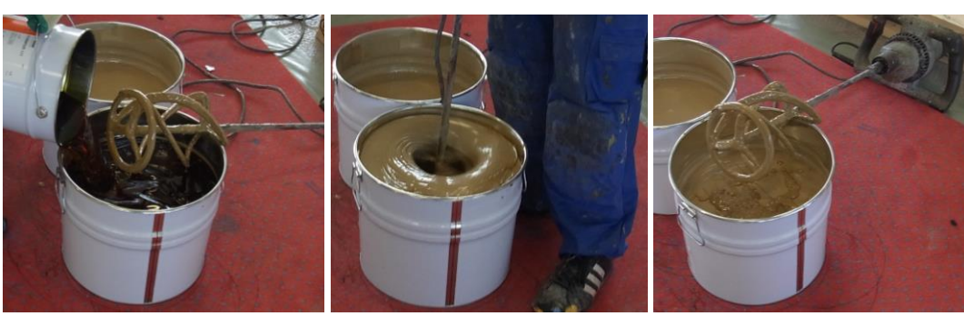
Mixing of the 2-component PU adhesive

Before installation mix both components of adhesive. Directly after mixing, pour all of the glue out evenly over the prepared installation area (approx. 0.7kg/m² if using SPORTEC 700 2K-PU adhesive ) so that none is left in the pot. Follow adhesive manufacturer's instructions if not using SPORTEC 700 2K-PU adhesive.