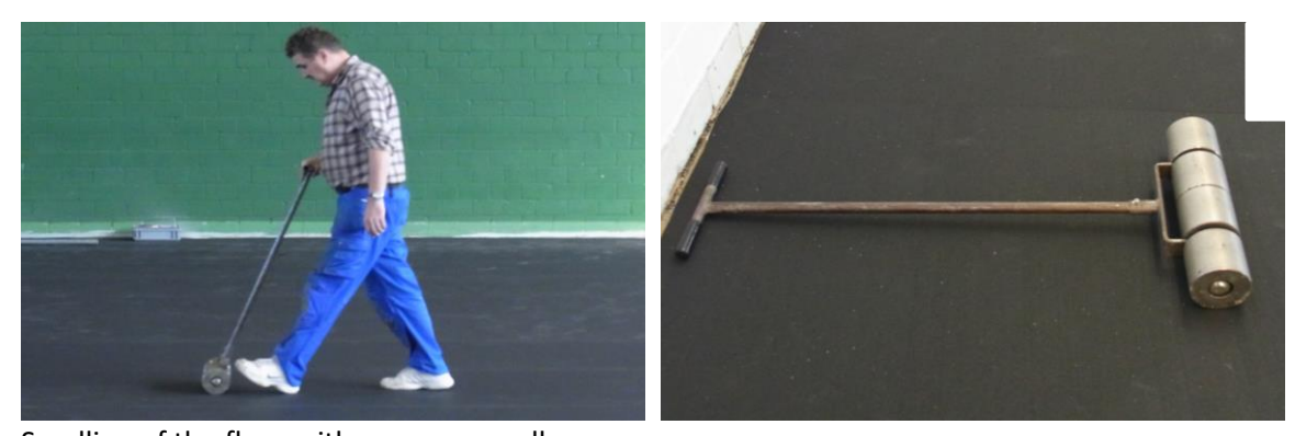
Scrolling of the floor with a pressure roller

After the adhesive has grabbed but before adhesive is fully cured, contact pressure should be applied to the surface with a roller to eliminate air bubbles underneath the material.