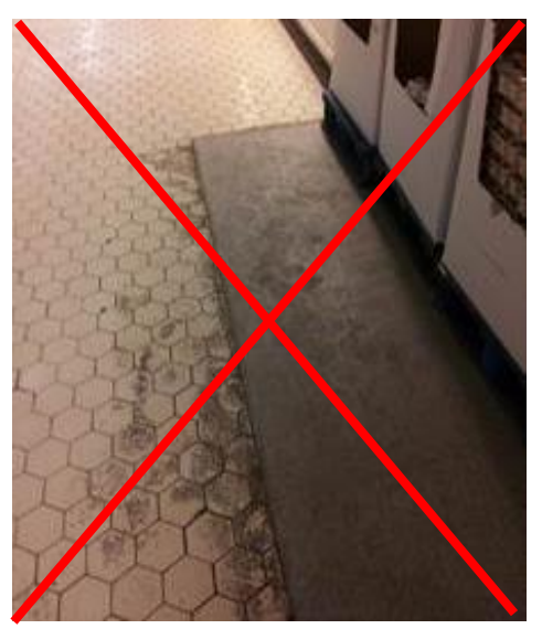
not suitable substrate