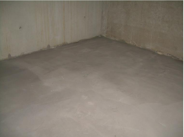
Even, suitable substrate made of poured screed

Depending on the substrate, it may be advisable to prime the substrate with a suitable (barrier-) primer.