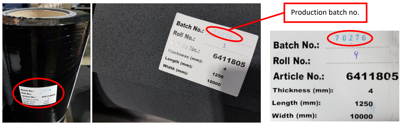
Example for a production reference batch no.

As shown in the picture below where possible use material from the same production batch, and install rolls in ascending number order. To find the production batch reference and the roll numbers, refer to the labels on the underside of each roll.