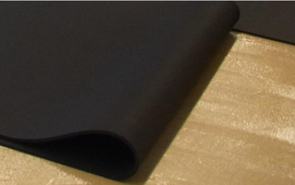
roll out into the adhesive bed

The installation recommendation is not subject to any change service! All information is without guarantee. Latest version of this document available on <a href="https://www.kraiburg-relastec.com/sportec">www.kraiburg-relastec.com/sportec</a>