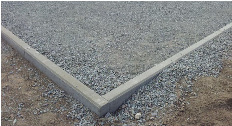
Prepared substrate with edge borders

The surface of the substrate has to be relieved of leaves, branches and other pollutions. Unevenness must be removed before starting with the installation. The elastic layer is delivered in rolls and has to be stored at site for about 1-2 days by a temperature of 15°C-25°C to ensure correct acclimatization. On the day previous day to installation, roll out the material in the way it should be installed so that the rolls can relax.