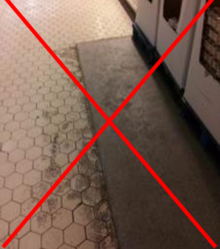
Even, suitable substrate made of poured screed