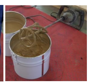
Mixing of the 2-component PU adhesive