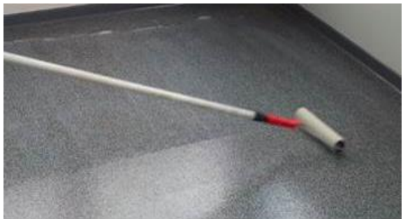
Applying of the coating