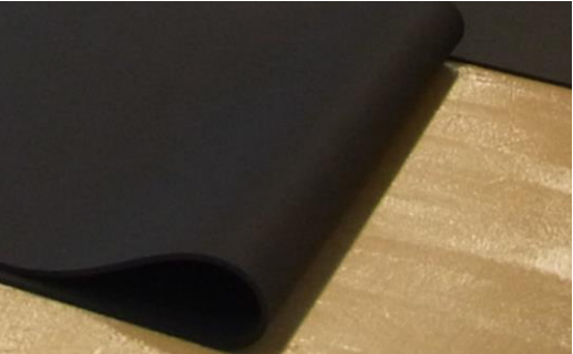
Adhesive applying onto clean substrate; roll out into the adhesive bed

Ensure that the roll is installed the correct way up (the underside of the roll has a label/sticker) and roll out straight. Roll out the material in same direction every time and position the adjoining edges flush against one another so that there are no gaps between adjacent rolls.