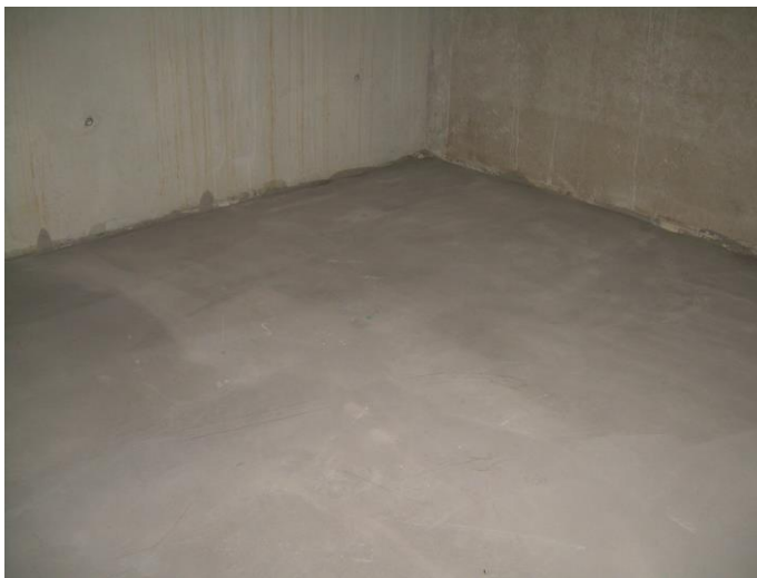
Even, suitable substrate made of poured screed

Depending on the substrate, it may be advisable to prime the substrate with a suitable (barrier-) primer.