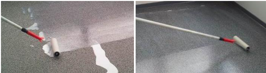
Applying of the coating

Depending on the final application, the flooring should be coated with the RZ turbo protect zero sealing lacquer (except UNI versa). In general, the material should be coated when flooring is used for indoor areas.