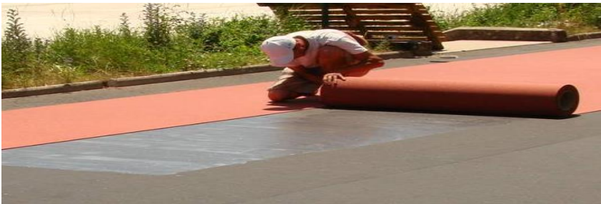
Rolling out the top layer over the elastic layer

Apply the glue evenly with a notched trowel over the area where SPORTEC® UNI classic/versa will be rolled out. Use a notched trowel with a notch depth as recommended by the adhesive manufacturer to achieve the correct spread rate. After the glue is spread out correctly, roll the material out into the adhesive bed (please take note of different adhesives curing time).