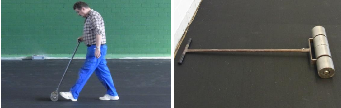
Scrolling of the floor with a pressure roller