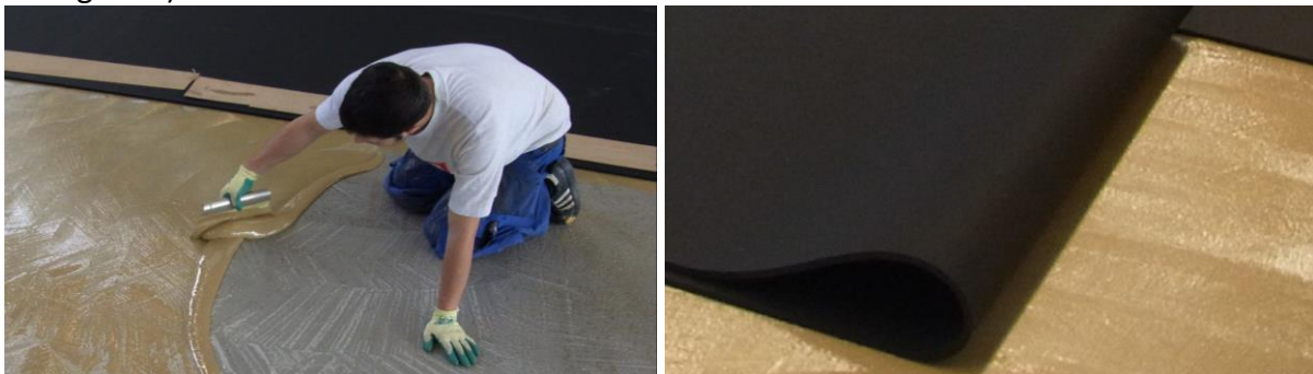
Adhesive application to clean substrate; roll out into the adhesive bed

Apply the glue evenly with a notched trowel over the area where SPORTEC® standard 2.0 will be rolled out. Use a notched trowel with a notch depth as recommended by the adhesive manufacturer to achieve the correct spread rate. After the glue is spread out correctly, roll the material out into the adhesive bed (please take note of different adhesives curing time).