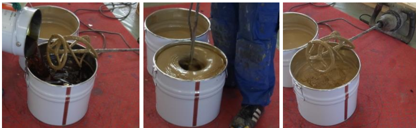
Mixing of the 2-component PU adhesive