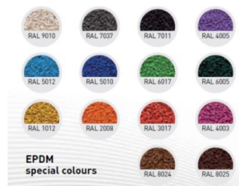
EPDM special colours