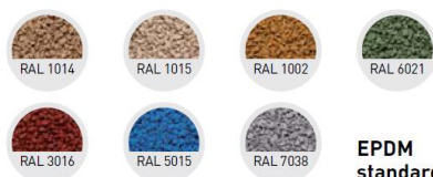
EPDM standard colours

Steel anchor D approx. 42,8 mm, L = approx. 750mm