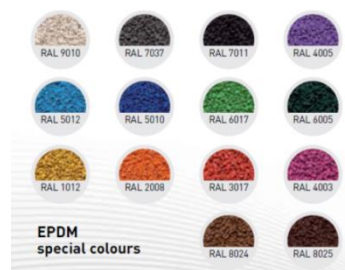
EPDM special colours