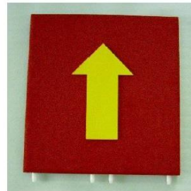
Colour Impact Protection Slabs: red,