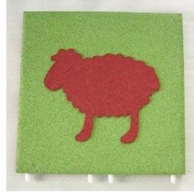
Colour Impact Protection Slabs: green,